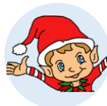
FRIENDLY FESTIVE FRED