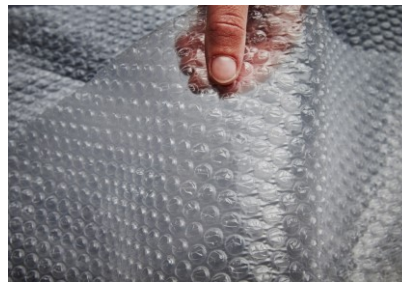
Bubble Wrap: Snap, Crackle, POP!

https://www.youtube.com/watch?v=x3flgs79dxQ