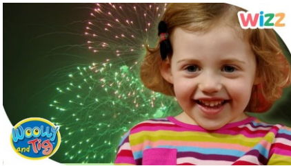
Woolly and Tig- Bonfire Night Special

https://www.youtube.com/watch?v=x3flgs79dxQ