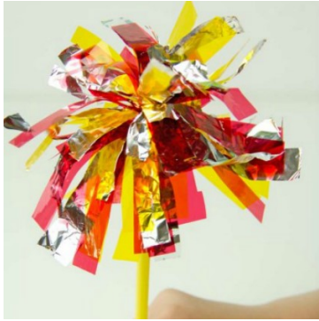
Tinsel and Straw Sparklers