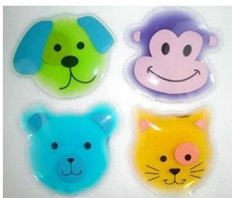
Children's Hand Warmer