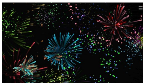
Mobile Device Apps