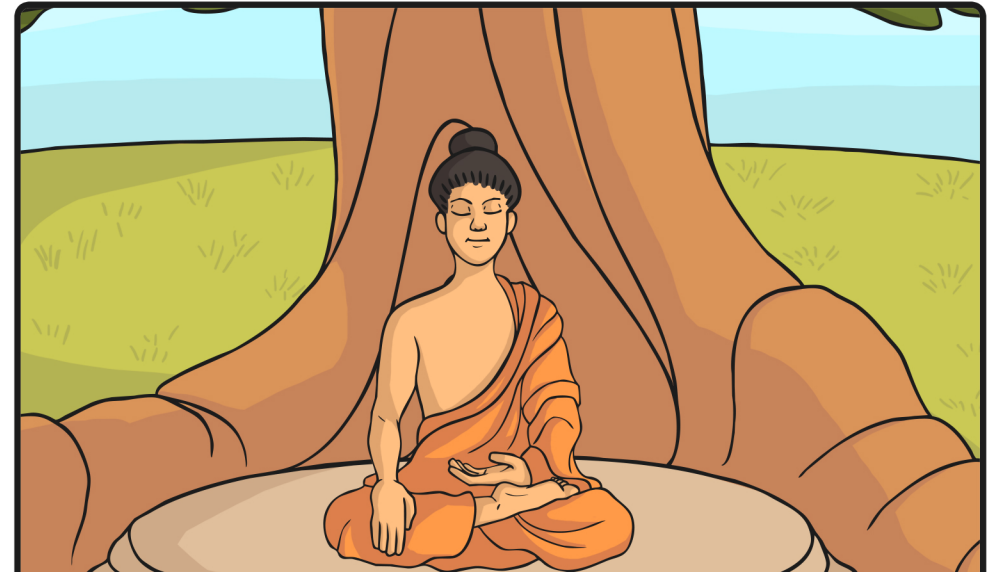
Dressed as a monk, he went to meditate under a Bodhi tree and promised himself that he wouldn't rise again until he found the truth. As he sat, he thought carefully about the past, present, future and the four sights he saw when he left the palace. After some time, he realised there was a way for people to end their pain and sadness. Within this moment, he became wise and enlightened.