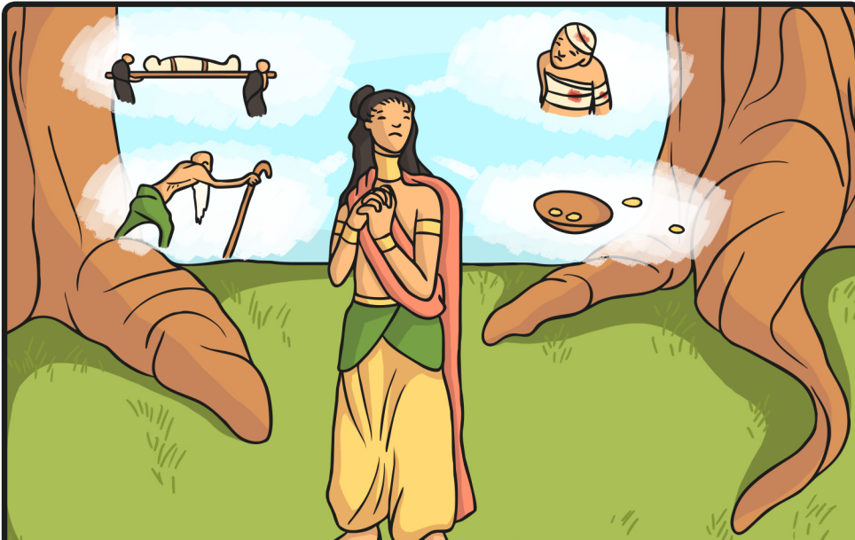
These four sights were a turning point for Siddhartha. He wanted to know if there was more to life than sickness, old age and death so he decided to leave his riches behind and go and find out for himself.