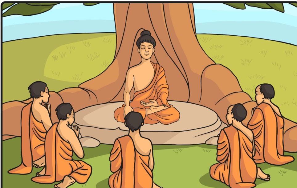
He began to teach people about what he had realised and people began to call him Buddha or 'teacher'. He taught them the Four Noble Truths.