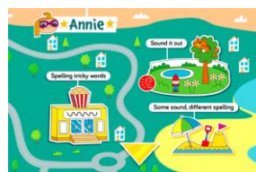
Game - Small Town Superheroes

It has a great selection of games for spelling, grammar, punctuation and lots more! Pick a different game from yesterday.