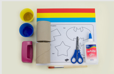
- Superhero cuff templates