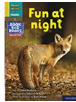
Fun at Night (page 2)

Copy and complete the sentences on page 14 into your jotter.