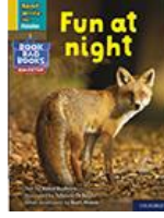
Fun at Night (page 2)

Copy and complete the sentences on page 14 into your jotter.