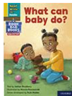
What Can Baby Do? (page 2)

Copy and complete the sentences on page 14 into your jotter.