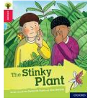
The Stinky Plant (page 3)

Here is another book for you to read today. It practises the igh sound that we are learning about this week.