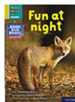
Fun at Night (page 2)

Copy and complete the sentences on page 14 into your jotter.