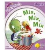
Sound Blending 2 and/or Mix, Mix, Mix (page 1)