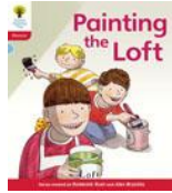
Painting the Loft (page 3)