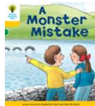
A Monster Mistake (page 3)