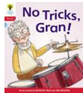
No Tricks Gran (page 3)