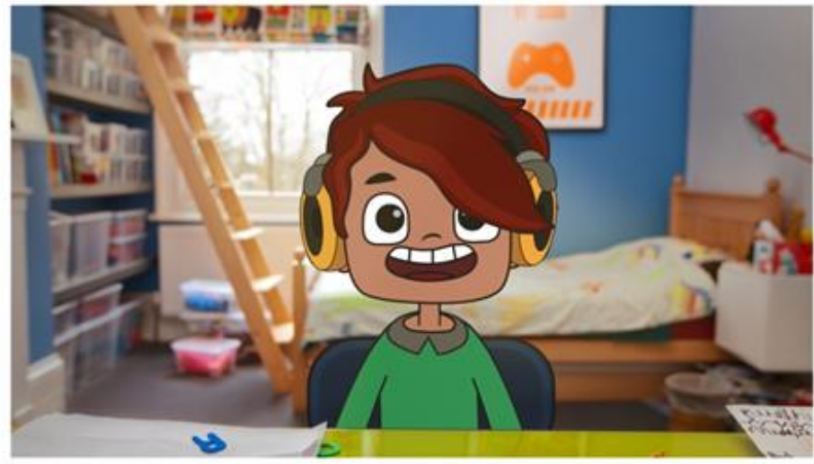
Tips&Tricks to beat the boss