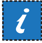
Tourist information centre