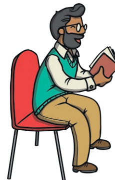
table snow door cloud plane friend book teacher banana chimney