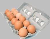
A dozen eggs - 40d