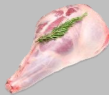
A leg of lamb - 60d