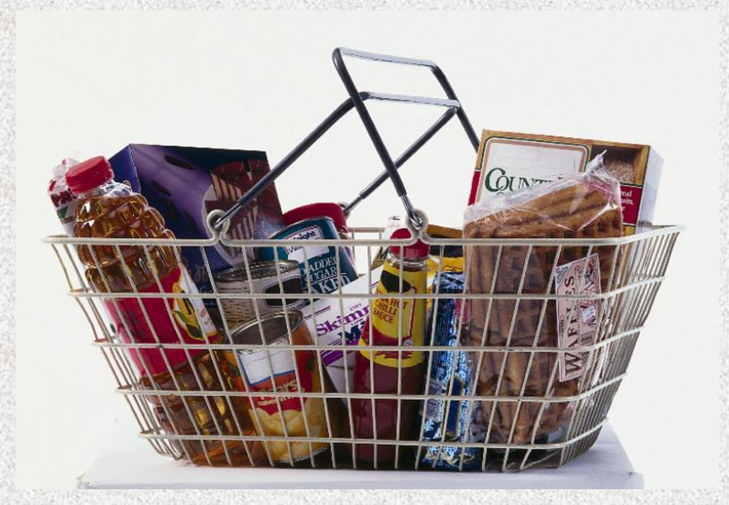
Everyone seems to be complaining....