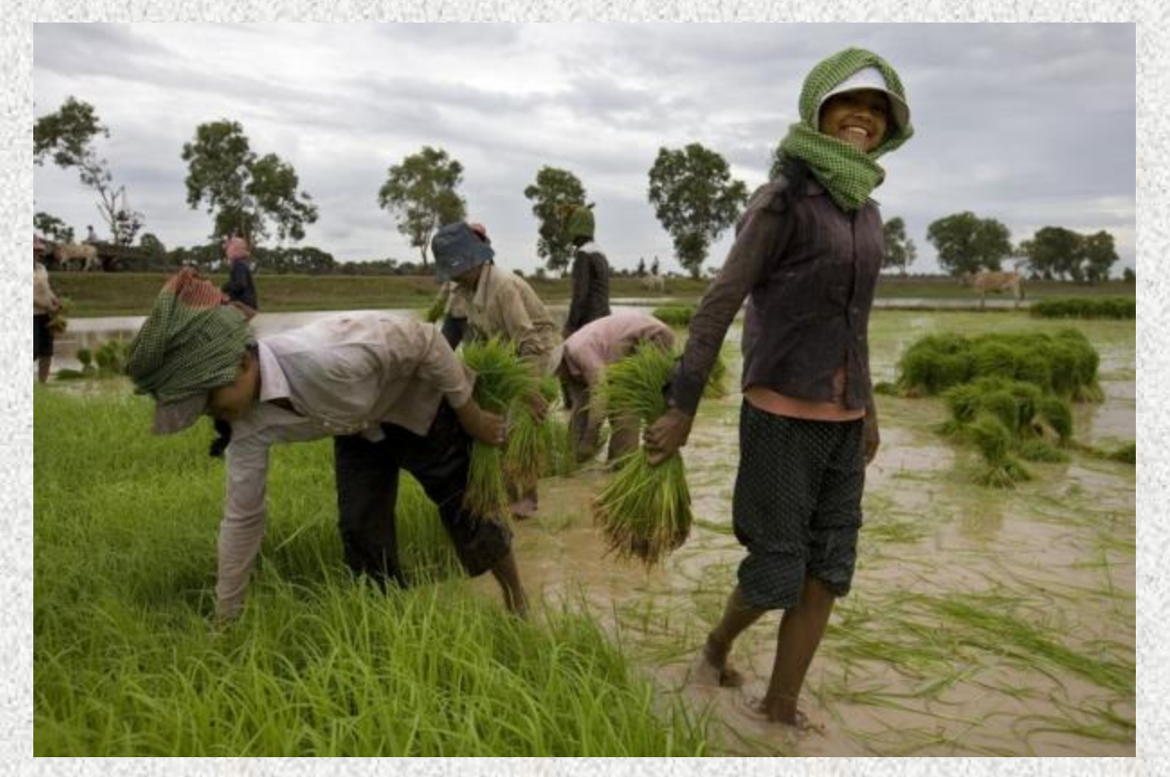
Kompong Thom, central Cambodia