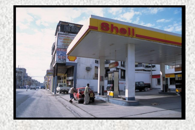
Rising oil prices