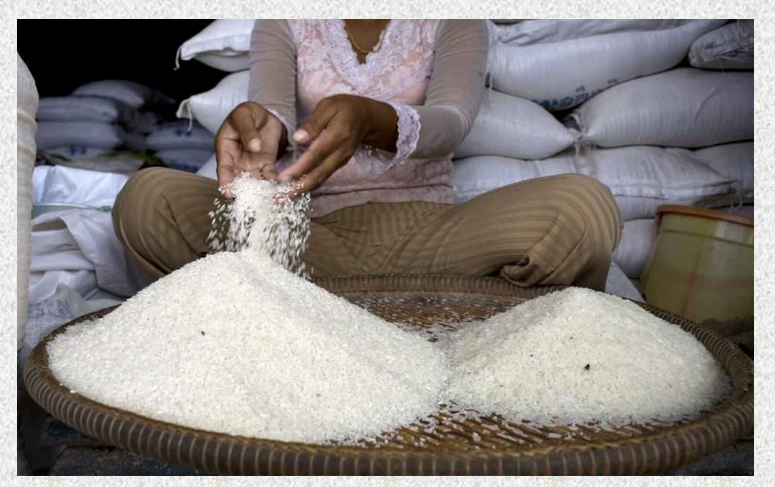
Phnom Penh, Cambodia