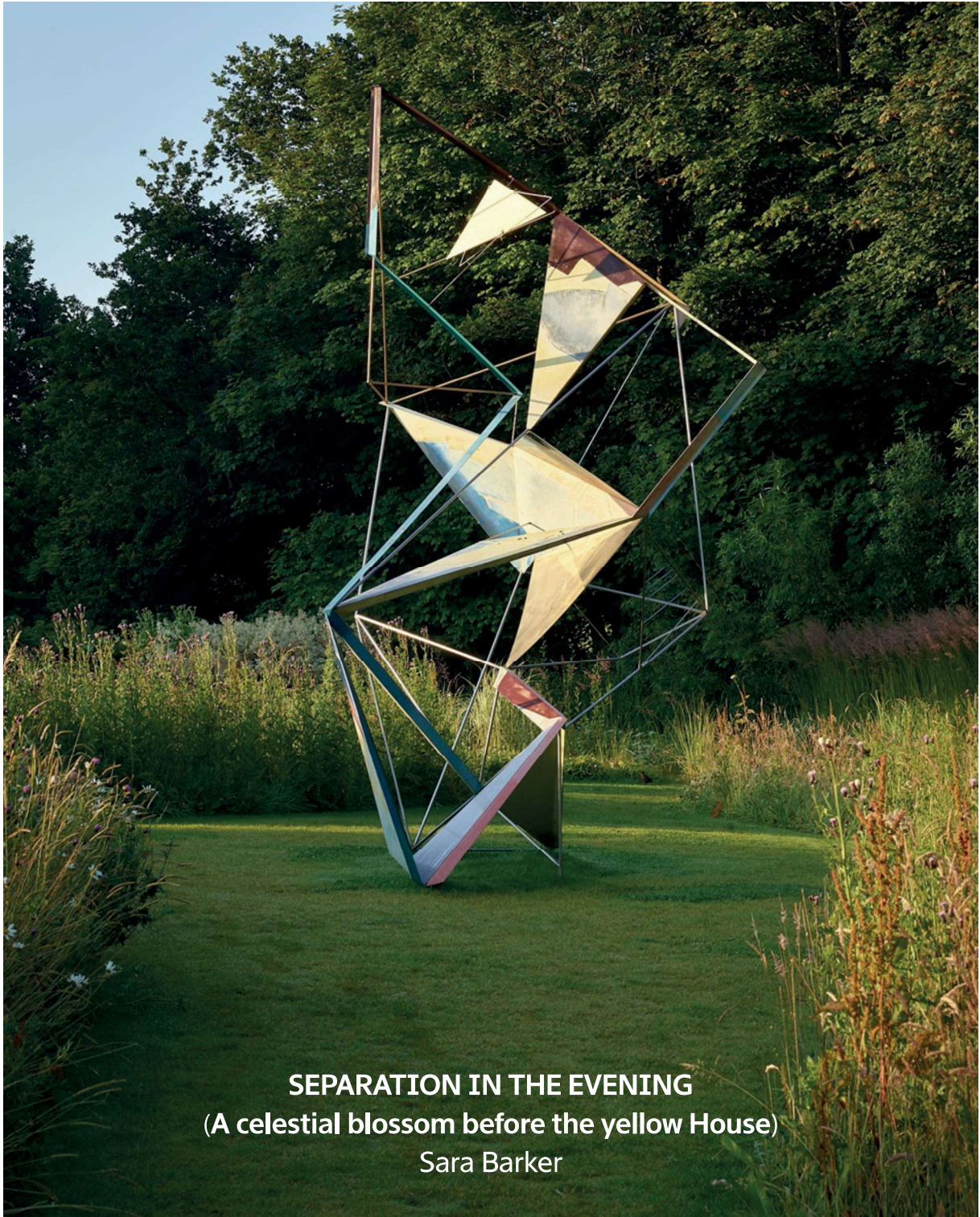
SEPARATION IN THE EVENING (A celestial blossom before the yellow House) Sara Barker