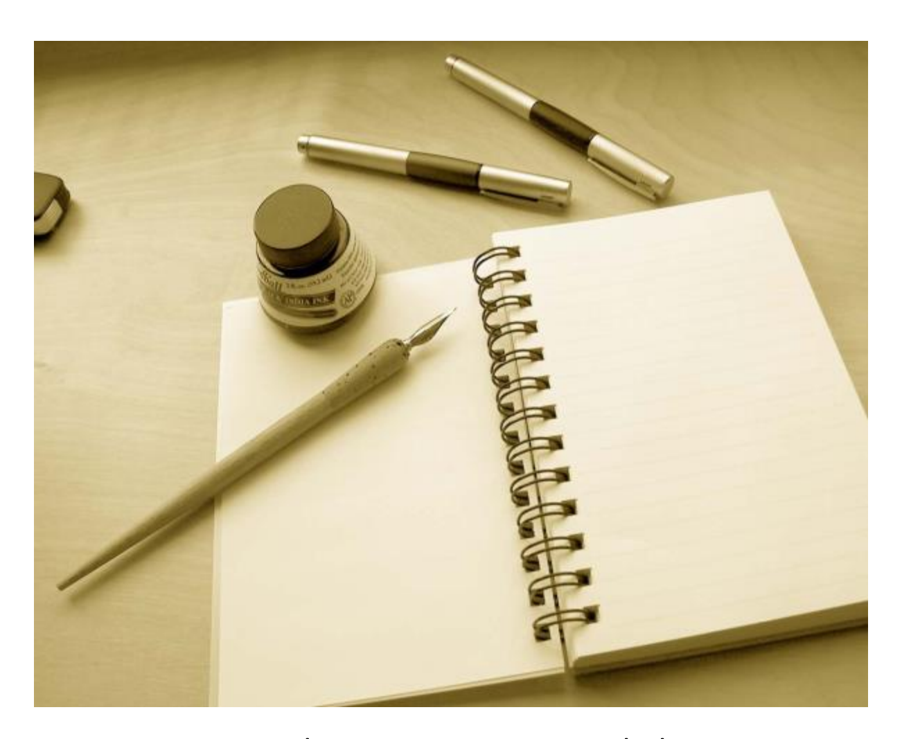
P3 Homework activities week beginning 16.11.20