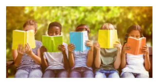
2 - Literacy - Phonics 'ou' sound

Practise writing out the following 'ou' words three times.