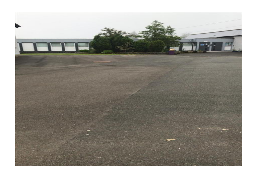
I will have the same playground as I did in P4.