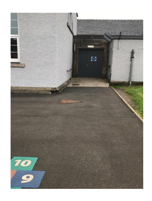
I will line up in the in the mornings, break times and lunchtimes here.