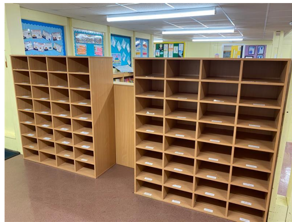
This is where I will keep my shoes.