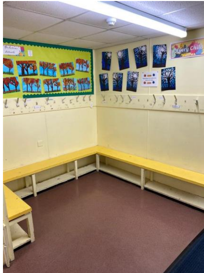
This is my new cloakroom.