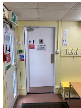
I will use the same toilets as I did in P5.