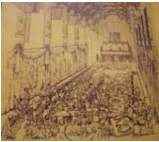
Drawing of the great hall