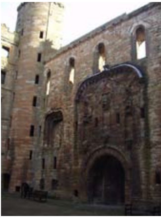
East range from the courtyard

King James I wanted Linlithgow to be a wonderful 'pleasure palace'. He spent a tenth of all his money on building the palace!