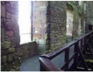
Walkway in the north range

Water used to be unfit for drinking so people – including children – drank ale, a kind of beer. The palace has its own brewery, under the east wing. If you were part of the royal family or one of the nobles, you would drink wine.