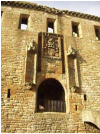
East entrance from the outside

Originally the walls of the palace would have been covered with a coat of something called lime harl – like plaster? You wouldn't have seen the stone.