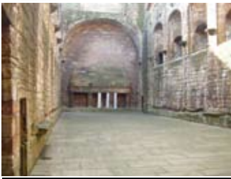
The Great Hall

Sometimes when visitors became too full during a banquet, they would disappear to be sick before coming back to eat some more! The story goes that they would make themselves sick by tickling their throats with feathers.