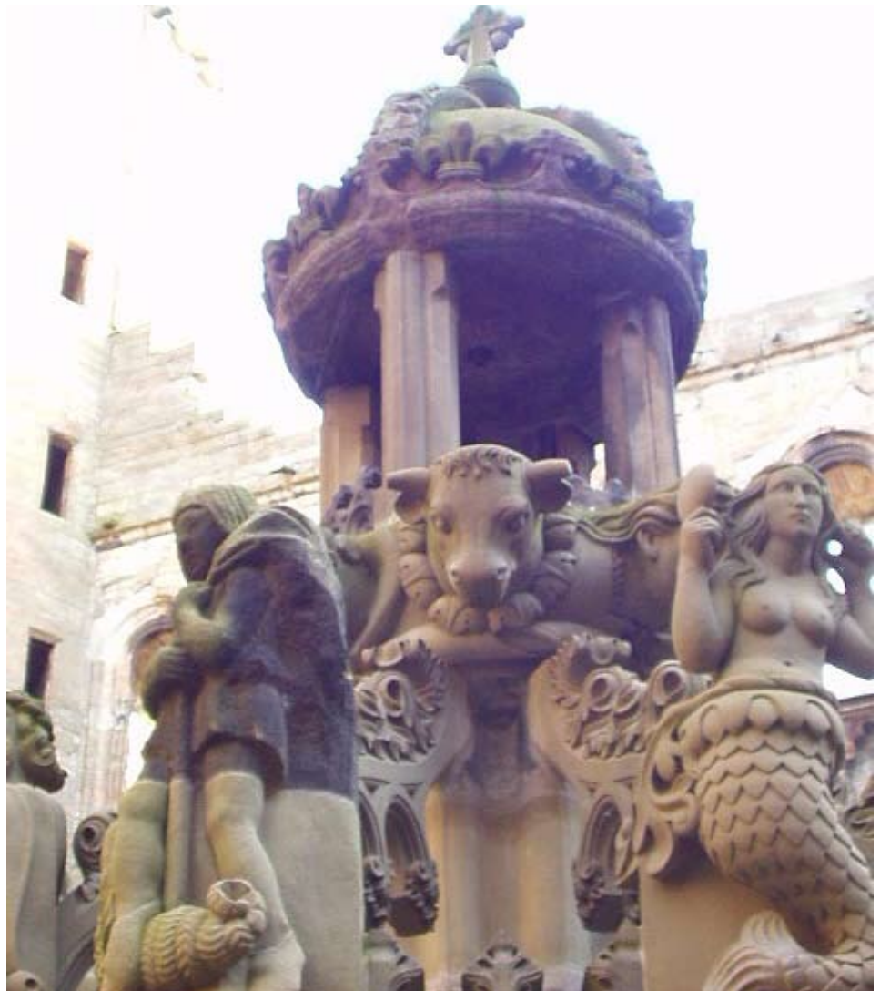
Detail of fountain

Walk over to the old entrance. Stand just under the arch on the courtyard side.