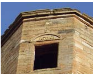
Date on north range