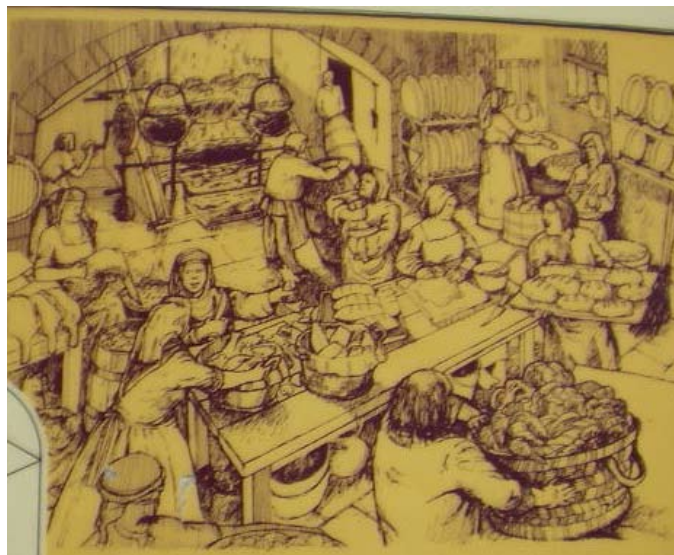
Drawing of the court kitchen in use

Walk into the great hall and stand just inside it, beside the serving hatches.