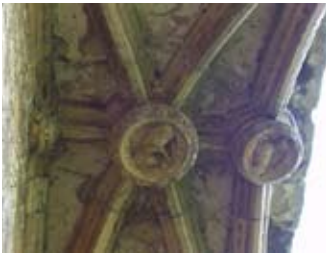
Decoration on oratory roof

Mary Queen of Scots was born in this palace. The room where she was born isn't here any more. She became Queen when she was only six days old and lived at Linlithgow for seven months before her mother took her to Stirling Castle for greater safety.