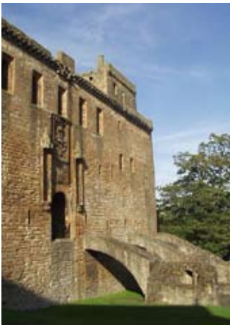
East range from the outside