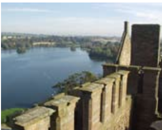
View north over loch