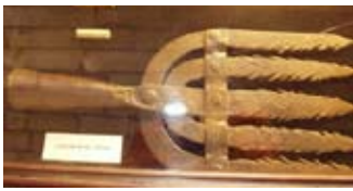
Eel spear, found in Linlithgow Loch