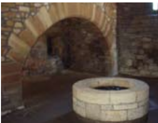
The Laich kitchen

Make your way down the stairs again, through the king's bedroom and then on the first floor head east along the modern walkway known as the New Wark.