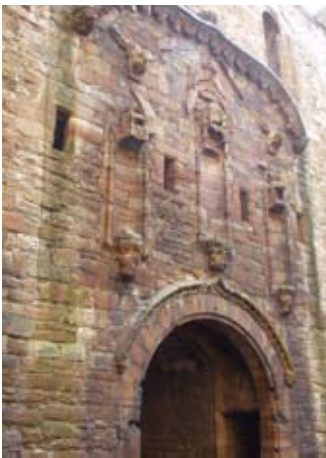
Old Entry from the courtyard

One of the duties of the guards was to ring the palace bell to tell everyone the time...but how did they know?