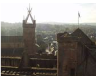
View from tower looking south