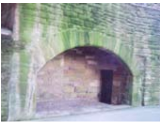
Fireplace in the court kitchen