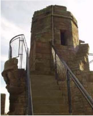
Queen Margaret's Bower

Stewart kings and queens enjoyed all kinds of sport. Such as bowls, practised archery, trained their falcons and went boating on the loch. They even played a special kind of tennis, which they called 'catchpule'.