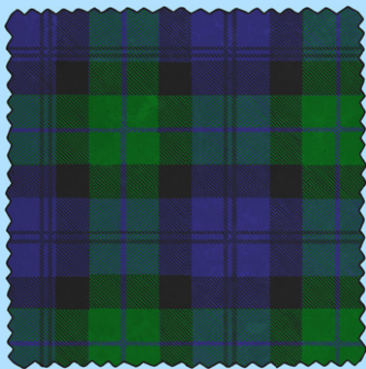
Black Watch Tartan

Tartan is a pattern consisting of criss-crossed horizontal and vertical bands in multiple colours. Tartans originated in woven wool, but now they are made in many other materials. Tartan is particularly associated with Scotland. Scottish kilts almost always have tartan patterns.