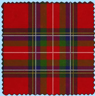
Royal Stewart Tartan