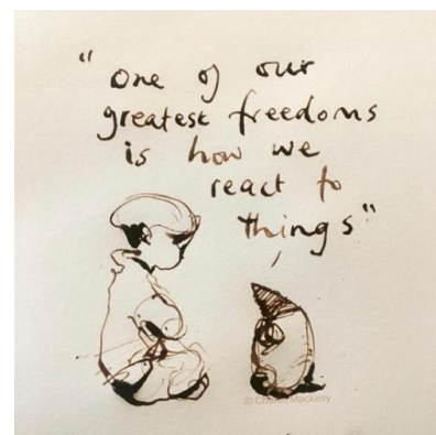
The boy, the mole, the fox, and the horse,