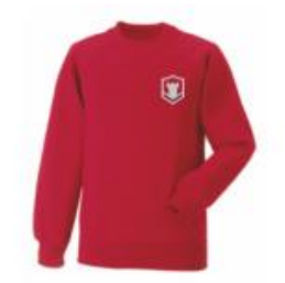
CREW NECK SWEATSHIRT

PE kit: shorts/ leggings, t-shirt, indoor gym shoes