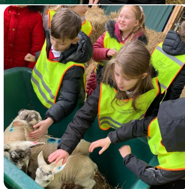
Primary 3 and 4 enjoying their visit to Arnprior Farm