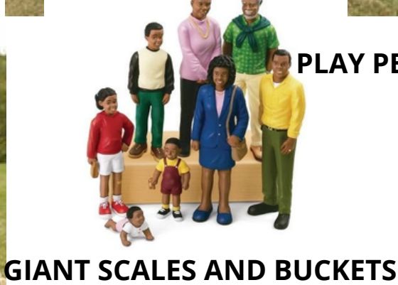
PLAY PEOPLE FAMILY