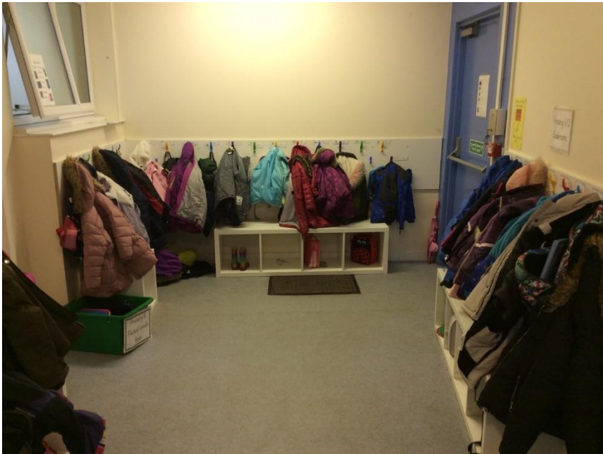
This is a picture of the P1 cloakroom and the door to our playground. We keep it very tidy.