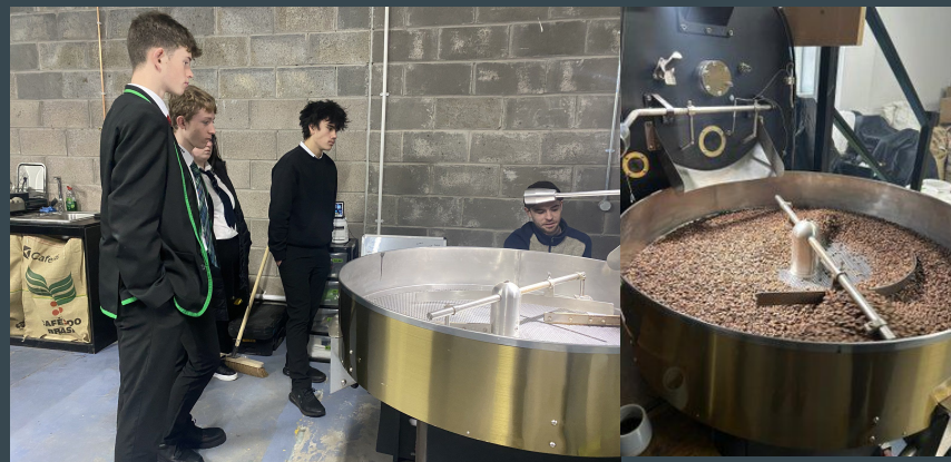
S6 Baristas trip to Parallel Coffee