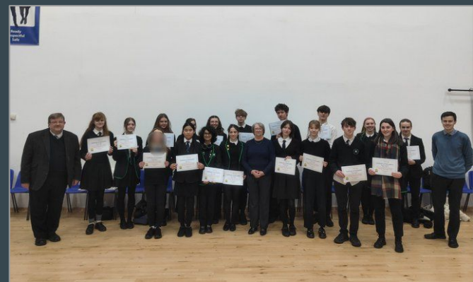
Rotary Young Musician of the year