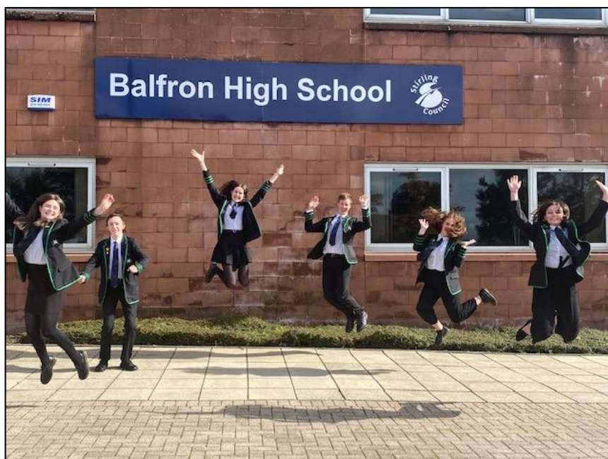
Head Prefects are appointed each session

Head Prefects are elected by their peers and staff. They are expected to organise the Prefect system and to represent the school on formal occasions. Six Prefects are elected as Head Prefects, each linked to a year group. They are the bridge to pupil counsel and influence decision making with the Senior Leadership Team.