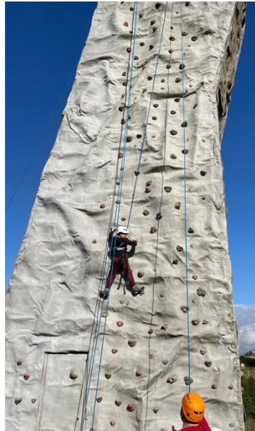
S1 Teambuilding determination!