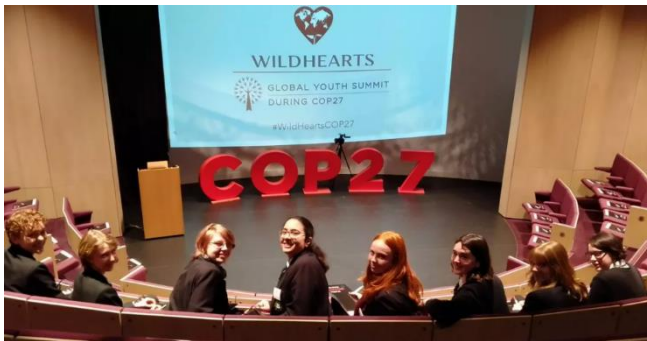
Eco Club Attending COP27