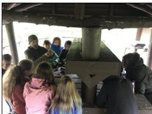
Pupils session at Forest Schools