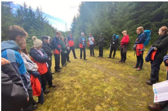
S4 Columba 1400 values discussion