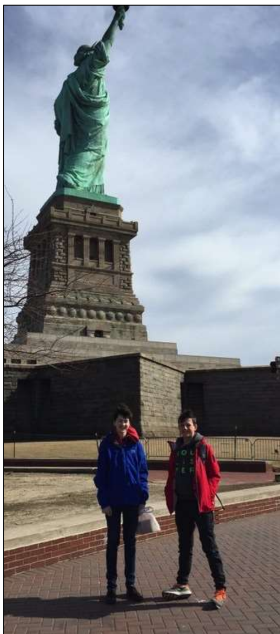
Balfron Highlights, May 2016

We really did have the most unforgettable and amazing time and we're sure New York will be seeing all of us again very soon.