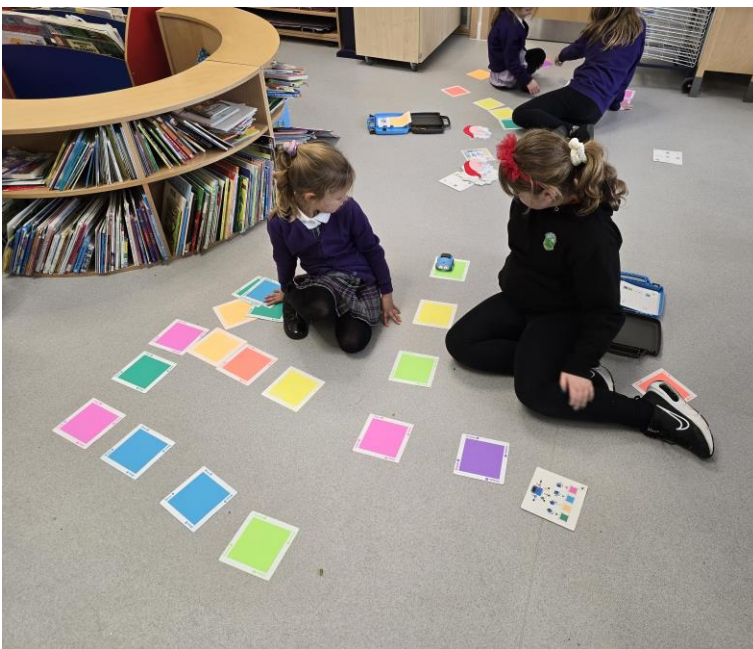
Coding P1 and P7

Staff also ensure all the learning that takes place is discussed with the pupils in terms of relevance for life/future learning; in terms of context, and that the pupils are involved in setting targets for and evaluating their learning. There is a very strong emphasis on skills for life, learning and work.