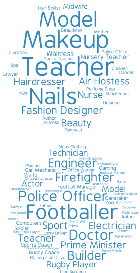
Children's ideas of jobs for women and men