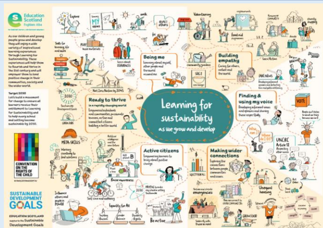
Education Scotland's LfS Sketchnote

This Outdoor LfS Wakelet , provided by Education Scotland, is a collection of online resources aimed at supporting outdoor learning and LfS. You'll find links to resources on the National Improvement Hub, Glow, various websites, and YouTube—all conveniently gathered in one place for easy access. Please ensure to review the suitability and availability of these materials, considering age and stage appropriateness.