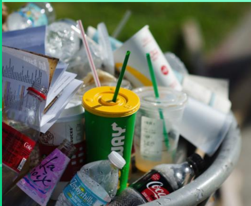
The Butterfly Effect

consider some of the problems that might be caused by a product designed to last for such a long time.