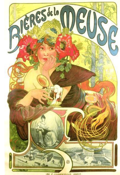
"Bieres de la Meuse", 1898, lithograph