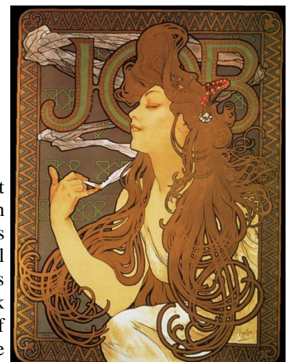
"Job", 1896, lithograph