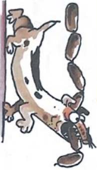
a bad dog

These words are adjectives . They are opposite in meaning.