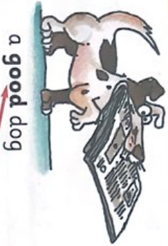
a good dog

Opposites are words whose meanings are as different as possible from each other.