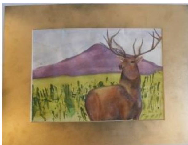
Examples of art and technical work