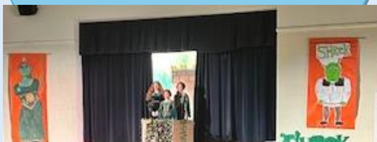
Happiness Excellence Achievement Respect Teamwork