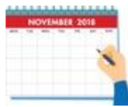
Dates For Your Diary

A little reminder that boys and girls should bring their own water bottles to school.