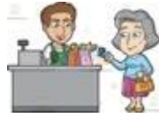
Paying For School Activities

Children who receive subsidised meals, linked to income support can access free milk every day. Their milk should not be booked via Parent Pay.