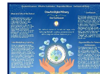
New Curriculum Rationale!