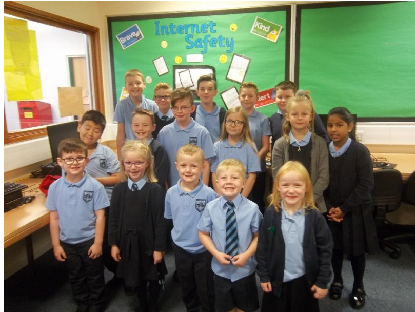
The Digital Learning Pupil Group Nov 2019

meet once a month to discuss their priorities and each member is given the chance to feedback to their class.