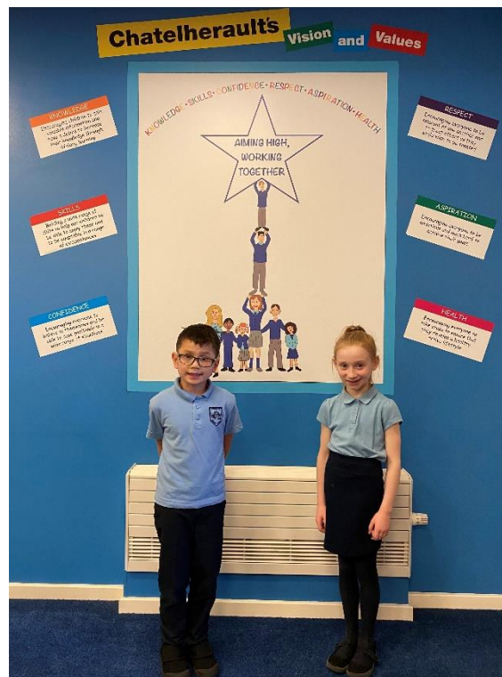
Primary 3 pupils showing our Vision & Values display

For Education Resources this means delivering services of the highest quality as well as striving to narrow the gap. It is about continually improving the services for everyone at the same time as giving priority to children, young people, families and communities in most need. The priorities for schools and services are set out in the Education Resources Plan which confirms the commitment to provide better learning opportunities and outcomes for children and young people.