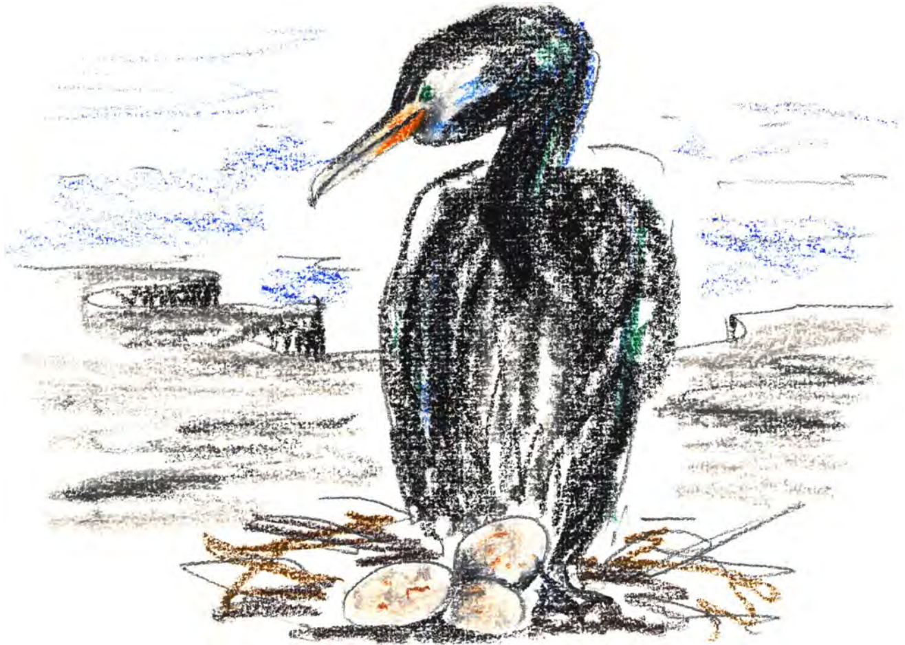
The shag's eggs are big.