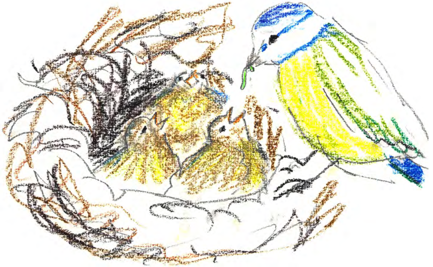
Baby blue-tits like caterpillars.