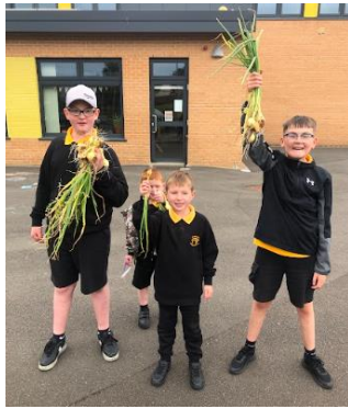
A Successful Harvest