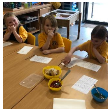
Tasting Foods Linked to Cultural. Religious Celebrations