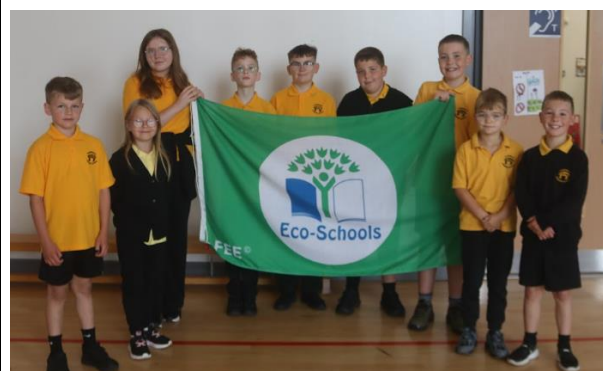
Our Eco Committee