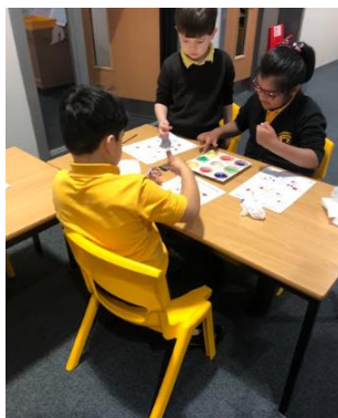
Creating Symmetrical Designs