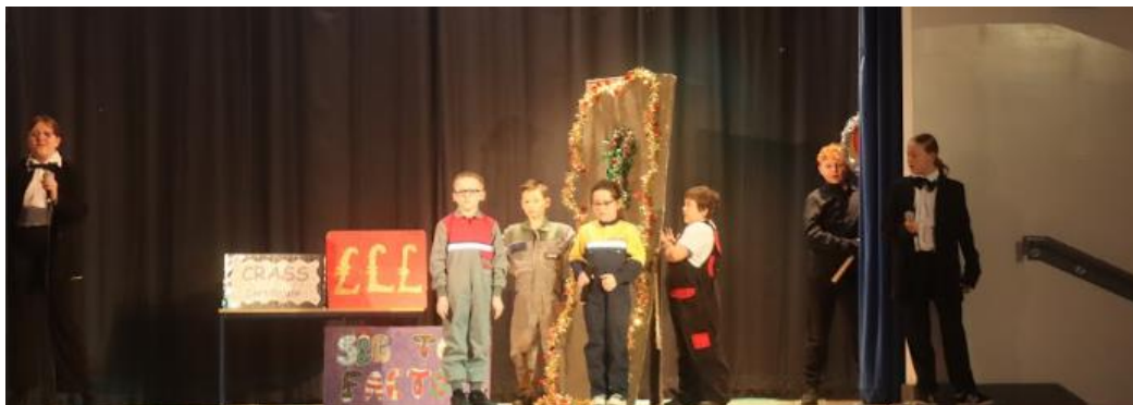
A scene from our Christmas Show