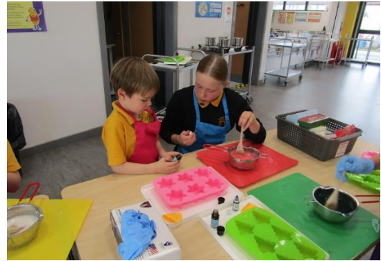
Soap and Bath Bomb Making