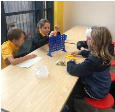
Breakfast Club Fun