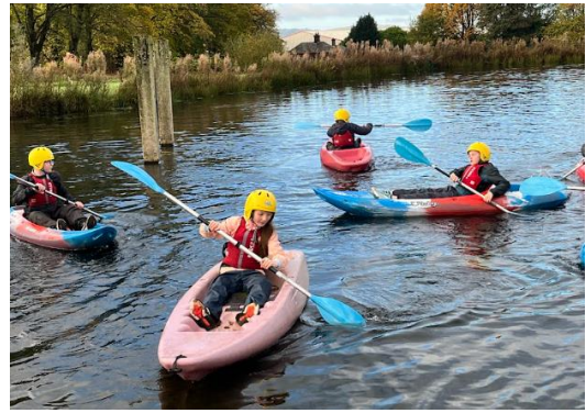
Lockerbie Manor 2025