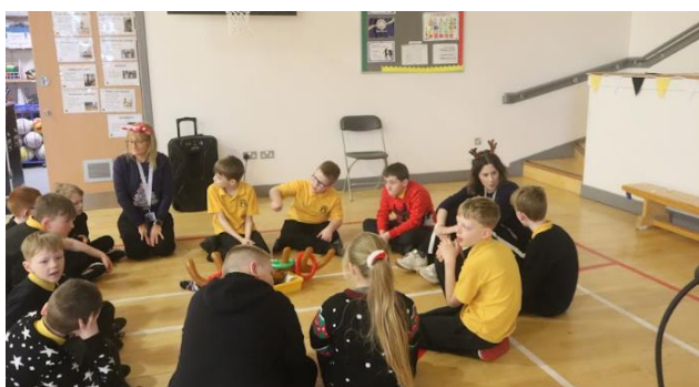
The Christmas Fun Assembly