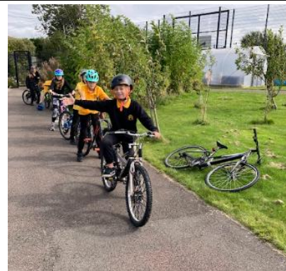
Bikeability Level 2