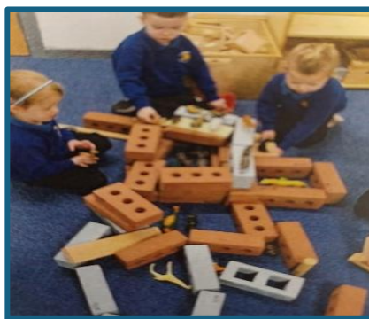
"We are building a huge zoo" It has different pens for different types of animals that the children grouped together.