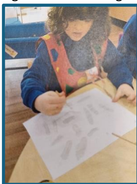
"Zebras look like horses but have black and white stripes" Eve