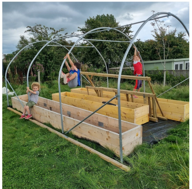
Images above: Work progressing on the new polytunnel in the school grounds with the help of local families