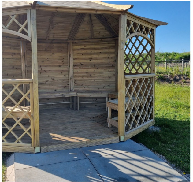
Images above: The pagoda from the old school (which burned down) and the new one built in 2023. The primary seven leavers all mentioned the loss of the original pagoda/gazebo as something that had really impacted them and were pleased the new one had arrived before they headed to high school!