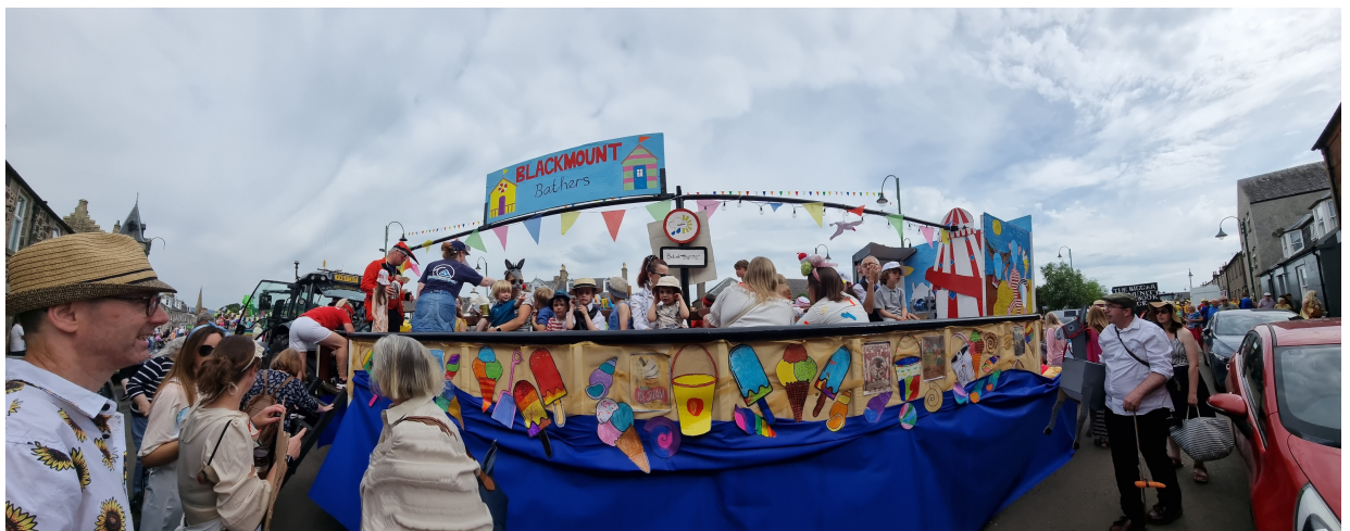
Images above: Side view of the Biggar Gala Day float from 2023 - prize winner