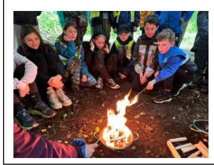
Outdoor Education Forest schools