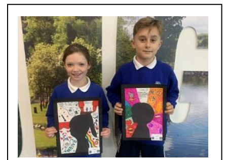
Biggar Little Festival