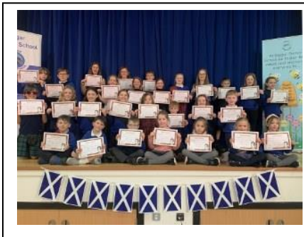
Burns Poetry Competition