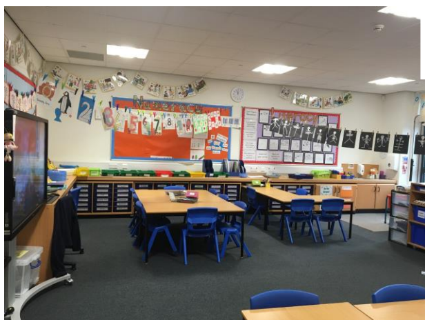
Inside a classroom