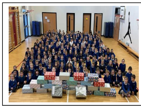
Global Citizenship-Rotakids Christmas Boxes for Ukraine