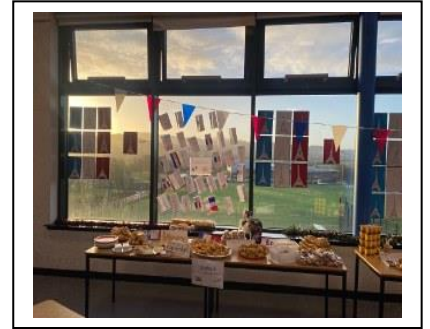
Languages 1+2 French showcase