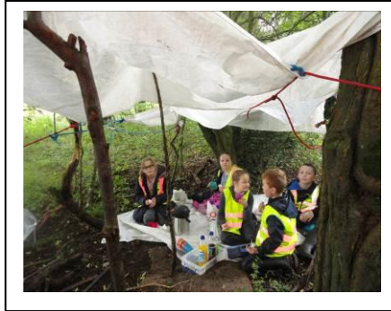
Outdoor Education Forest schools