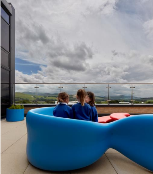
Roof Terrace and view