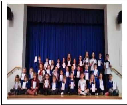
Burns Poetry Competition