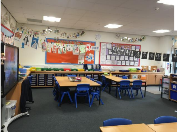
Inside a classroom