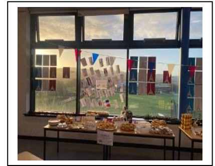
Languages 1+2 French showcase