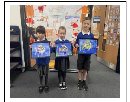
Biggar Little Festival