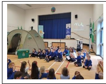
Global Citizenship-Rotakids Shelterbox