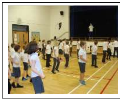
Global Citizenship Lepra