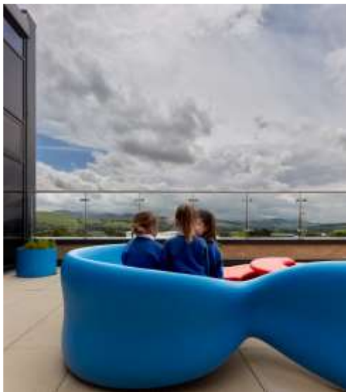
Roof Terrace and view