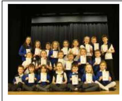
Burns Poetry competition