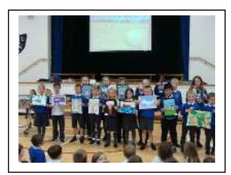
Biggar Little Festival