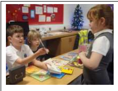
Rocking Readers bookshop Tycoon is the Business