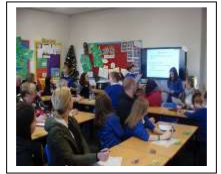
Languages 1+2 German showcase