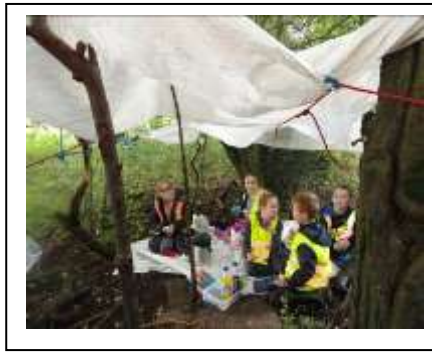
Outdoor Education Forest schools