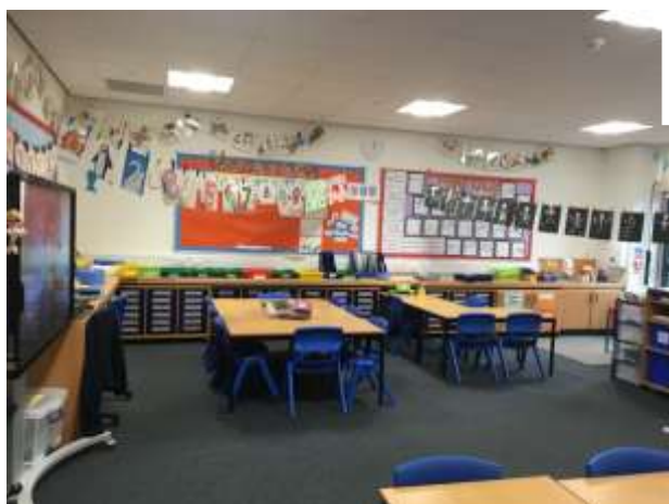
Inside a classroom