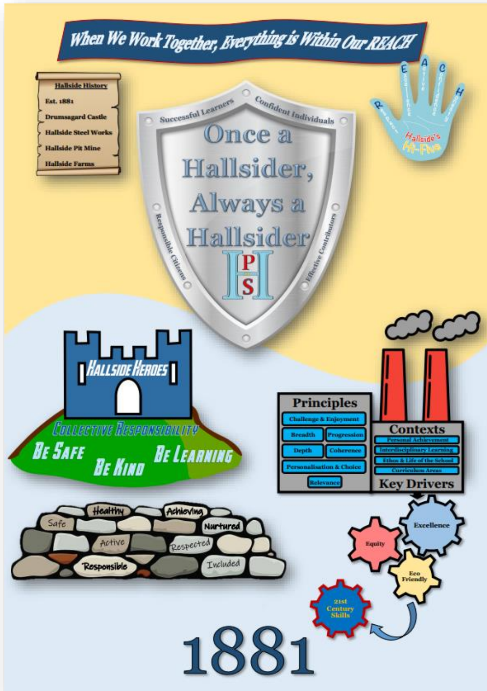
Hallside's Curriculum Rationale on a page

We continually review and develop our programmes ensuring: