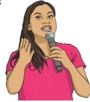
table to a rhythm or as the words to our favourite song!