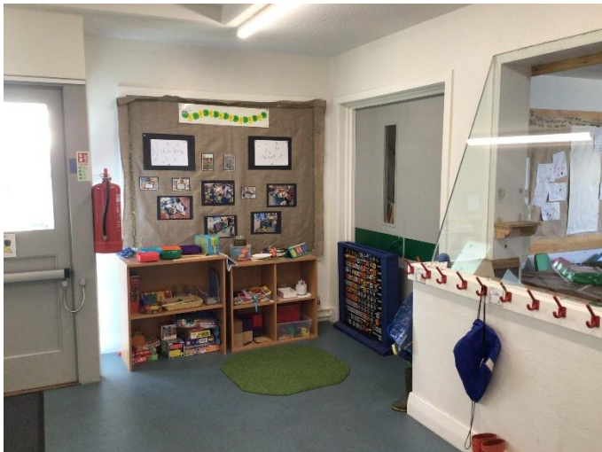
This is the primary play space that we share with the other primary classes and can come to play in.