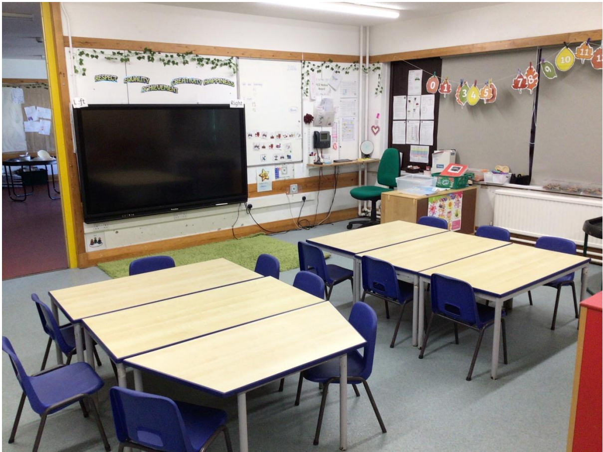
Here are the teaching tables.