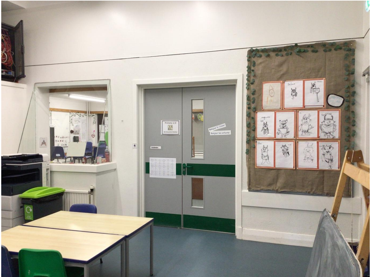
This is the door to the Primary 1 classroom.