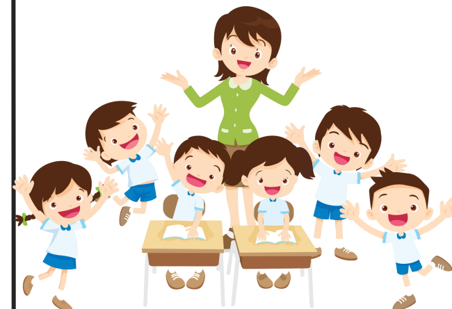
CLASS UPDATES ON PAGES 10-14.