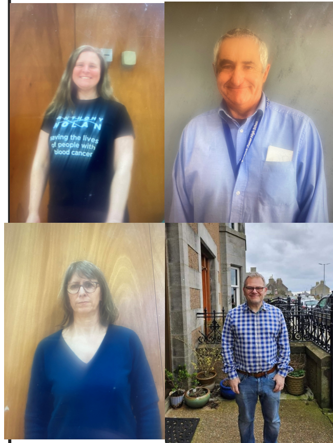
STAFF INTERVIEWS ON PAGES 3-8.