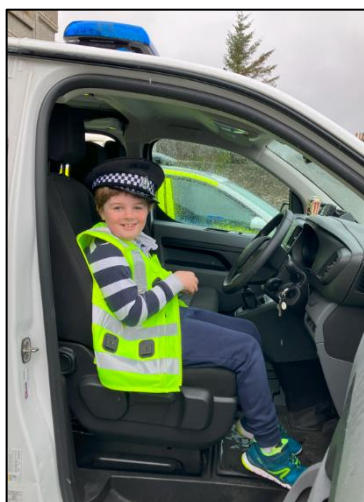
School trip to the Police Station March 2024