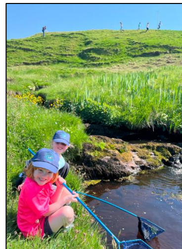
Fishing in the sunshine May 2024