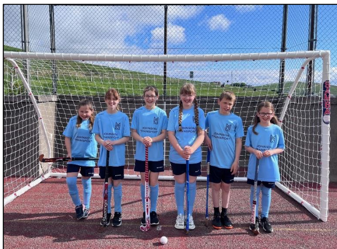
Our hockey players all ready for the hockey festival in Brae May 2024