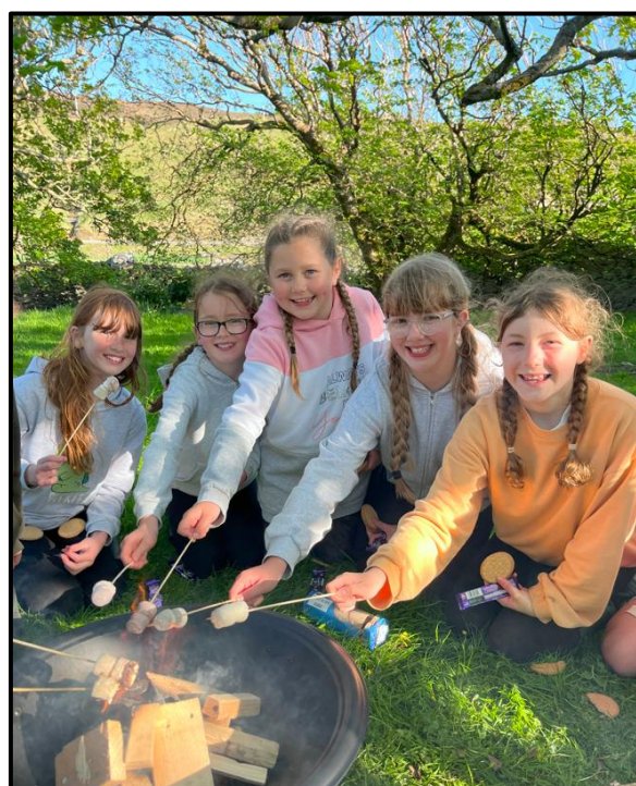
Toasting marshmallows at the fire pit May 2024