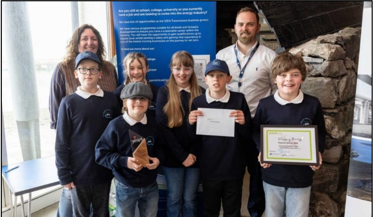
Primary 6 & 7 were winners at the Celebration of STEM day at the Shetland Museum in May 2024.