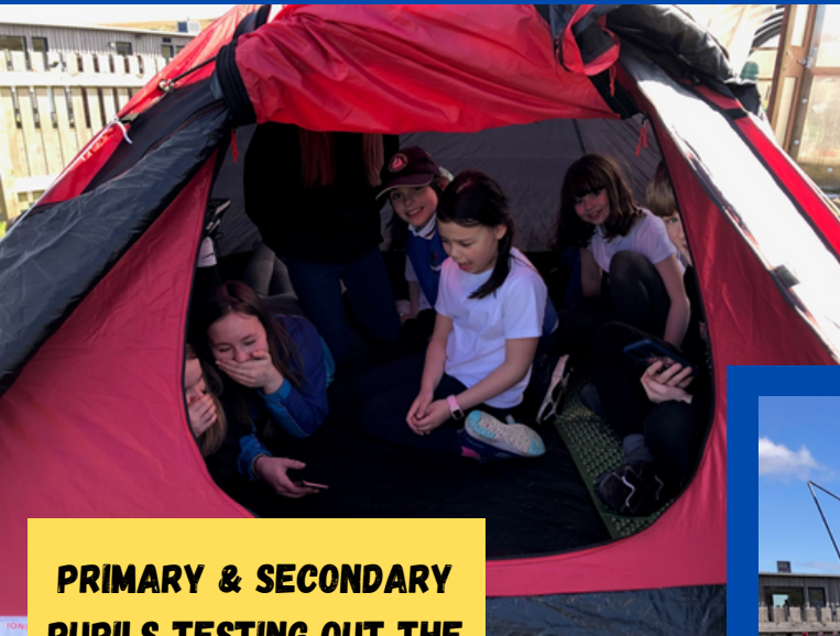
PRIMARY & SECONDARY PUPILS TESTING OUT THE TENT!

THEY WILL FOLLOW THIS IN THE SUMMER HOLIDAYS BY COMPLETING AN EXPEDITION WHERE THEY ARE COMPLETING AN EXPEDITION WITH THEIR TEAM AND WITH LESS DIRECT SUPPORT FROM US DOFE LEADERS. THANKS TO THE MEMBERS OF THE COMMUNITY WHO ARE SUPPORTING THESE YOUNG PEOPLE WITH THEIR SKILLS; PHYSICAL AND VOLUNTEERING SECTIONS OF THE AWARD – OUR YOUNG PEOPLE WOULD NOT BE ABLE TO GAIN THESE VITAL QUALIFICATIONS WITHOUT YOUR KINDNESS AND TIME COMMITMENT.