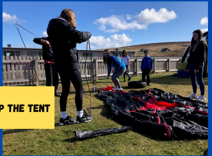
SETTING UP THE TENT